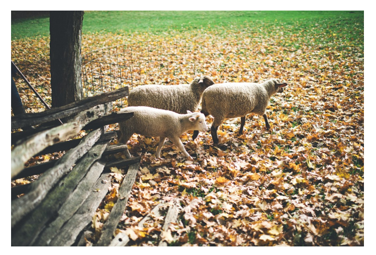
Today's Sermon: The Trouble With Prophets By Pastor Trotter

Meeting Sunday Mornings Downtown Dixon Mini-Mall 113 East First Street, Suite 130 Dixon, Il. 61021