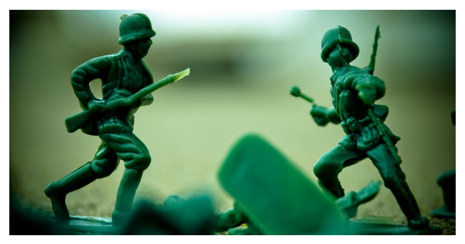
Today's Sermon: Intercessory Warprayer By Pastor Trotter

Meeting Sunday Mornings Downtown Dixon Mini-Mall 113 East First Street, Suite 130 Dixon, Il. 61021