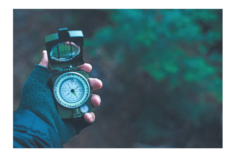
Today's Sermon: Checking the Compass By Pastor Trotter

Meeting Sunday Mornings Downtown Dixon Mini-Mall 113 East First Street, Suite 130 Dixon, Il. 61021