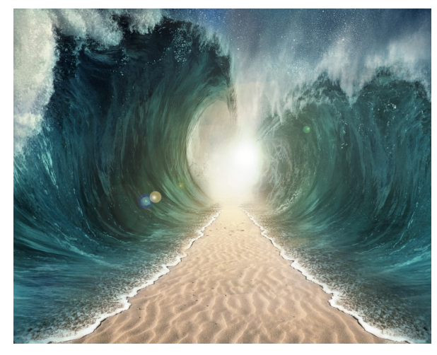
Today's Sermon: Now What!?!: Moses By Pastor Trotter

Meeting Sunday Mornings Downtown Dixon Mini-Mall 113 East First Street, Suite 130 Dixon, Il. 61021