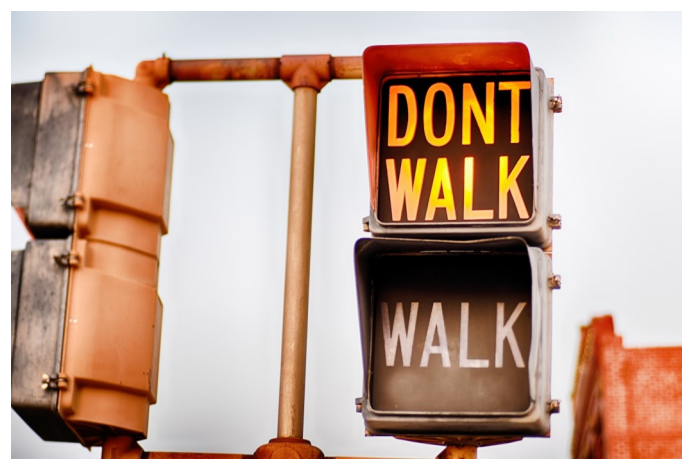
Today's Sermon: Now What!?!: Joshua By Pastor Trotter

Meeting Sunday Mornings Downtown Dixon Mini-Mall 113 East First Street, Suite 130 Dixon, Il. 61021