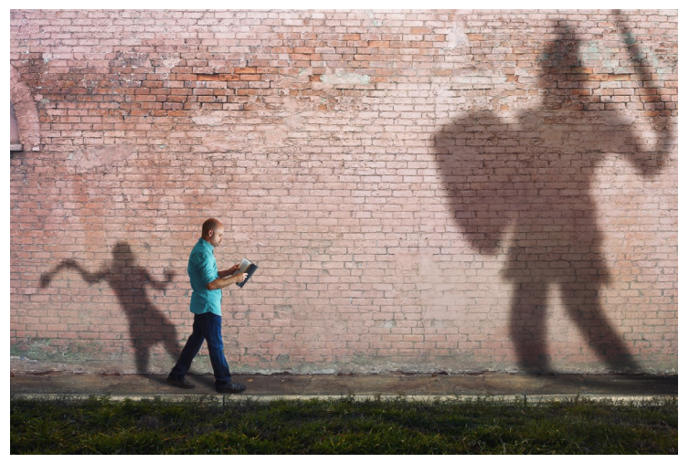
Today's Sermon: Equipped to Defend - Esther 8 By Pastor Trotter

Meeting Sunday Mornings Downtown Dixon Mini-Mall 116 East First Street, Suite 130 Dixon, Il. 61021