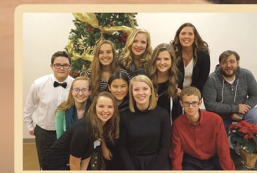
Submerge Pekin First

Pekin First Nazarene 3514 Broadway St. Pekin, IL 61554 Childcare ONLY with pre-registration by March 16 @ nwilnaz.org