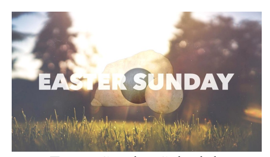
Easter Sunday Schedule

April 19th will be an Introduction to Discipleship 2017 all lessons offered until the following Wednesday will be on Introduction to Discipleship 2017. Training on Wednesday, April 26th will be at Living Well on Lesson #1 Pursuit of Holiness and all lessons offered until the following Wednesday will be on Lesson #1 Pursuit of Holiness. We are hoping this format will provide flexibility for busy schedules, if you need to miss a training there are opportunities during the week to get the training somewhere else.