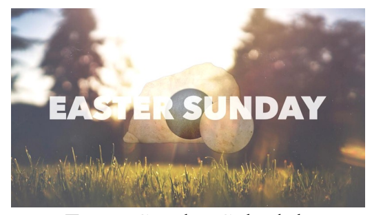
Easter Sunday Schedule

April 19th will be an Introduction to Discipleship 2017 all lessons offered until the following Wednesday will be on Introduction to Discipleship 2017. Training on Wednesday, April 26th will be at Living Well on Lesson #1 Pursuit of Holiness and all lessons offered until the following Wednesday will be on Lesson #1 Pursuit of Holiness. We are hoping this format will provide flexibility for busy schedules, if you need to miss a training there are opportunities during the week to get the training somewhere else.