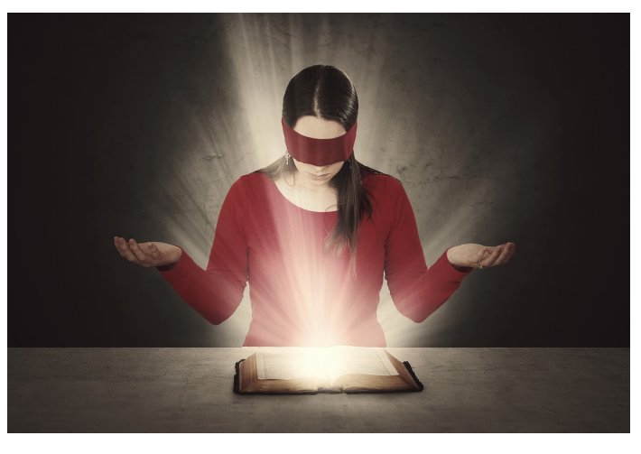
Today's Sermon: Light in the Darkness, Matthew 5:14-16 by Rev. Renee Kindle

Downtown Dixon 116 East First Street Dixon, Il. 61021