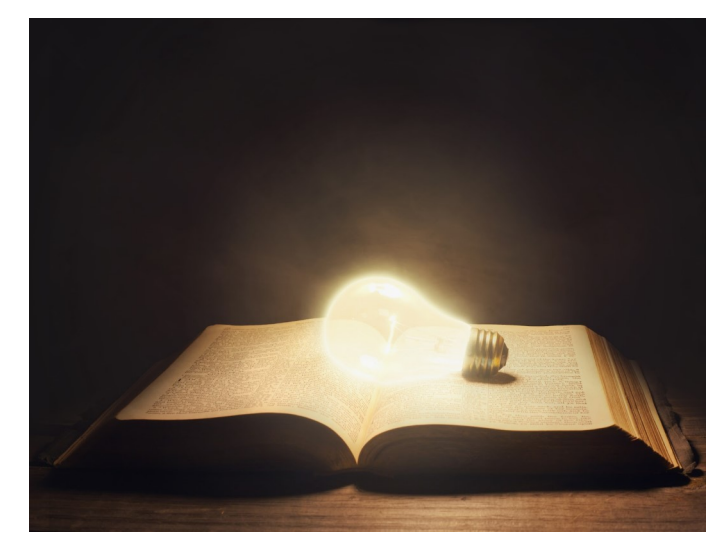
Today's Sermon: In the Beginning was the Word By Bill Young

Meeting Sunday Mornings Downtown Dixon 116 East First Street Dixon, Il. 61021