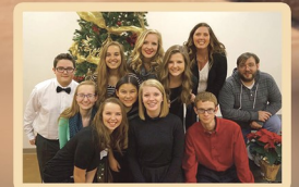
Submerge Pekin First

Pekin First Nazarene 3514 Broadway St. Pekin, IL 61554 Childcare ONLY with pre-registration by March 16 @ nwilnaz.org